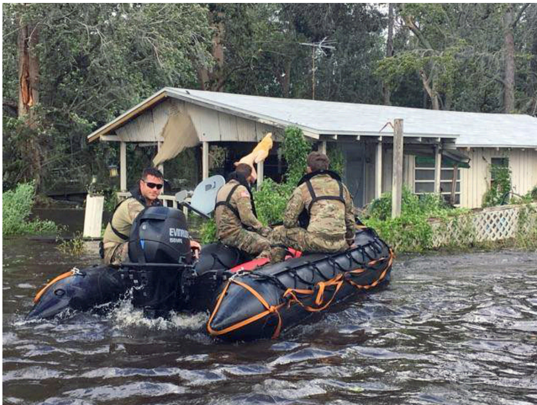
Florida Army National Guard soldiers went door to door in Jacksonville, Florida performing search and rescue missions on September 11th, 2017 after the impact of Hurricane Irma.